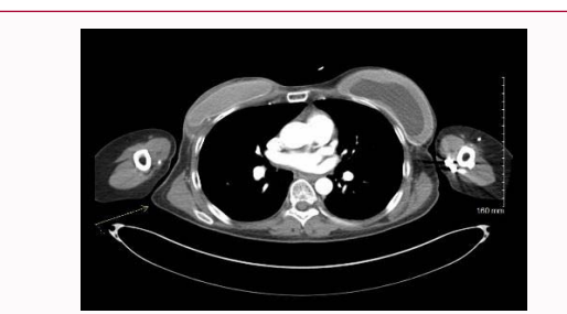
Figure 1: Case 1; Preoperative CTA showing perforators of the TDA.

A 44-year old BRCA2 mutation-positive woman initially presented with multifocal right breast cancer which required mastectomy and radiotherapy. She also had Factor VII deficiency, which was deemed a relative contraindication to autologous free tissue transfer due to the additional risk of bleeding and microsurgical compromise. She was therefore treated with bilateral mastectomies (left prophylactic, right therapeutic with right sentinel lymph node biopsy (negative) and immediate breast reconstruction with subpectoral expanders (Becker-35<sup>TM</sup>) and Surgimend<sup>®</sup> Acellular Dermal Matrix (ADM) support. She did well in the early postoperative period. However, following adjuvant radiotherapy, she developed progressive Baker grade IV capsular contracture. Therefore 16 months after the initial operation, she underwent a right capsulectomy with an exchange of the subpectoral expander to a fixed volume anatomical cohesive silicone gel implant and total implant coverage with Braxon<sup>*</sup> porcine ADM. Over the following month, she had multiple seroma collections,