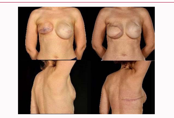
Figure 3: Case 1; Left pre-op, right post-op.

episodes of intermittent skin redness (differential diagnoses of cellulitis and "red breast syndrome") and partial wound breakdown that culminated in impending implant exposure. Therefore, she had an exchange of her right subpectoral prosthesis (totally covered with Braxon) for an expandable implant (Becker-35<sup>TM</sup>). Her recovery was, however, further complicated with multiple seromas (needing aspirations) and partial wound dehiscence. The wound was debrided and peri-implant seroma washed out with direct closure two months after her implant exchange. However, this was a temporizing measure and did not adequately address the underlying issue of poor skin quality. A salvage reconstruction of the right expander-reconstructed breast with a Thoracodorsal Artery Perforator (TDAP) flap was thus performed as expander inflation was not feasible (with the thinned out poor quality skin with severe radiation changes) whilst further implants were likely to fail in the context of severe radiotherapy skin changes, underlying scarring, subclinical infection, and poor skin quality. Preoperative CT angiography of the thoracodorsal perforating vessels showed them to be adequate (Figure 1). In her case the anterior-inferior capsule and pre-existing incorporated ADM tissue were excised, but the prosthesis was deemed intact and therefore preserved. This was re-inserted after washing out the pocket with 10% aqueous povidone-iodine (betadine). The flap was raised on