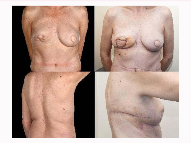
Figure 5: Case 2; Left pre-op, right post-op.

skin paddle measured 8 cm \times 25 cm. The flap subsequently settled well, correcting the cutaneous deformity and volume deficit, thus providing acceptable symmetry to the patient (Figure 5).