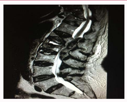
Figure 1: Sagittal image sequence in T2-weighted MRI showing a fracture in L2 and L1 with epidural hematoma extending from T12 to L3.