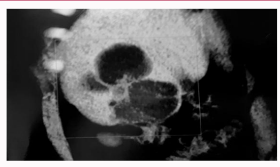
Figure 1: Hepatic cystadenoma. Contrast preoperative tomography showing a large solid cystic lesion septated in the right lobe.