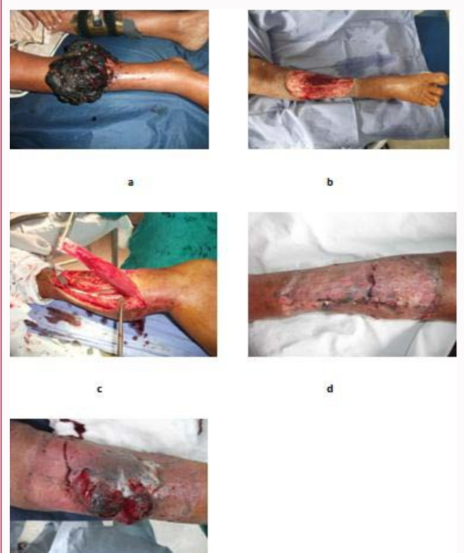
Figure 2: a) Recurrent pleomorphic sarcoma. b) Wide local excision. c) Medial Gastrocnemius muscle flap. d) Closure with skin graft. e) Recurrence after six months.

The patient presenting with suspected sarcoma is evaluated with