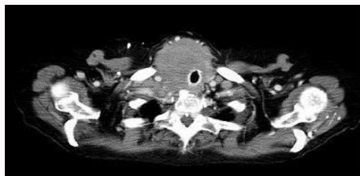
Figure 2: CT-scan after insertion of tracheal stent.