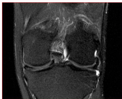
Figure 2: Preoperative MRI frontal scan of the right knee showing a bucket handle tear of the medial meniscus.

At the latest available examination (August 2020), the patient showed completed pain relief and full ROM and functional recovery.