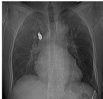
Figure 1: Standard Chest X-ray showing metal foreign object in the upper right hemithorax.

Copyright © 2016 Guiducci GM. This is an open access article distributed under the Creative Commons Attribution License, which permits unrestricted use, distribution, and reproduction in any medium, provided the original work is properly cited.