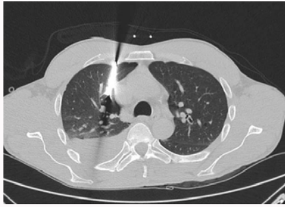
Figure 2: Chest CT showing the metal shard penetrating the superior lobe of right lung and resting in close proximity of the superior vena cava.